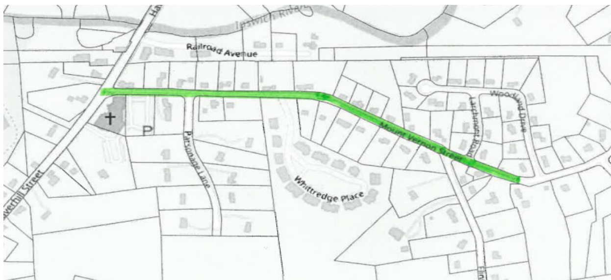
Mount Vernon Street Water Main Replacement – Haverhill Street to Woodland Drive

Mount Vernon Street: The existing water main in Mount Vernon Street between Haverhill Street and Woodland Drive will be replaced with an 8-inch diameter water main. It is anticipated this work will begin in late May. This work will also include “bypass” piping where the existing homes will be connected to a temporary piping system installed above ground while the construction is underway. The Contractor has estimated the water main installation in this area is anticipated to take approximately two to three weeks to complete. As with the other work, once the water main is in place, it must be pass pressure tests and water quality tests before the main can be activated. When the water main passes these tests, houses and water mains feeding the cross streets will be connected to the new main.