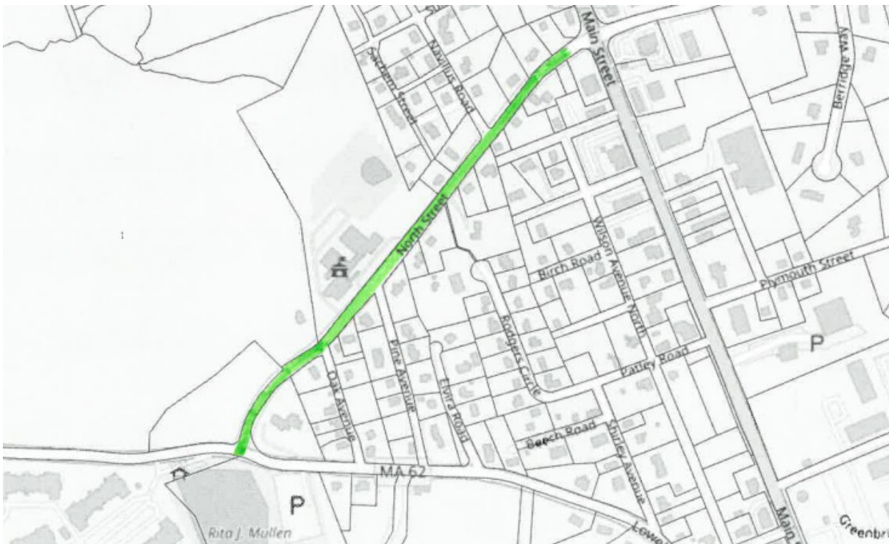
North Street Phase 1 Water Main Replacement – Lowell Road to Main Street

Phase 1 will take place beginning the week of April 5, 2021 and starting at the intersection of Lowell Road and North Street and proceeding up North Street to just west of the intersection of North Street and Main Street. The water main installation in this area is expected to take approximately three weeks to complete. Once the water main is in place, it must pass pressure tests and water quality tests before the main can be activated. When the water main passes these tests, houses and water mains feeding the cross streets will be connected to the new main.