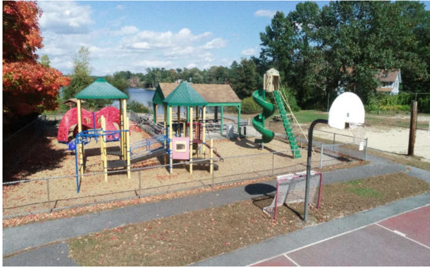
Clarke Park/Martins Pond