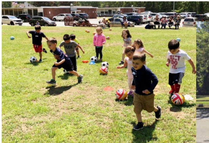
Town Hall Field