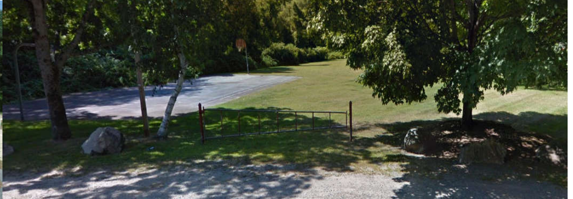
Park Street Park