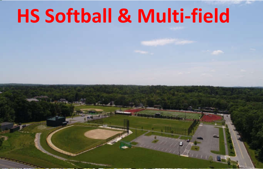
HS Softball & Multi-field