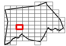
Map No. 24